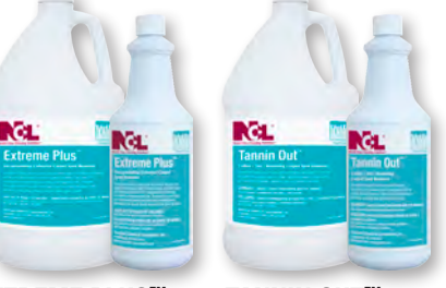
TANNIN OUT™ COFFEE / TEA / BROWNING CARPET SPOT REMOVER