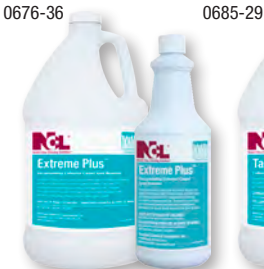
EXTREME PLUS™ ENCAPSULATING UNIVERSAL CARPET SPOT REMOVER

BIO-KLEEN PLUS™ PROTEIN SPOT & STAIN REMOVER